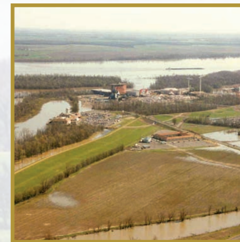
D-FIRM have been finalized in several Mississippi counties. Shown is a view of the Mississippi River near Robinsonville in Tunica County.

In rural, sparsely populated areas such as the Delta, FEMA is reluctant to spend the time and monies necessary to gather necessary information for generation of sound, correct maps. Two major components available to FEMA that were not considered in generating the maps, and which drastically affect the accuracy of these maps, is the newly available LIDAR data just released by the U.S. Army Corps of Engineers and the restoration of the Yazoo River System through the Upper Yazoo Project. LIDAR is the integration of three technologies into a single system capable of acquiring data to produce accurate digital elevation models. These new models are accurate within 0.2 feet, while the old digital elevation models