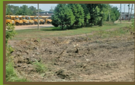
Clean-out at Rosa Fort High School has helped prevent flooding at the school.