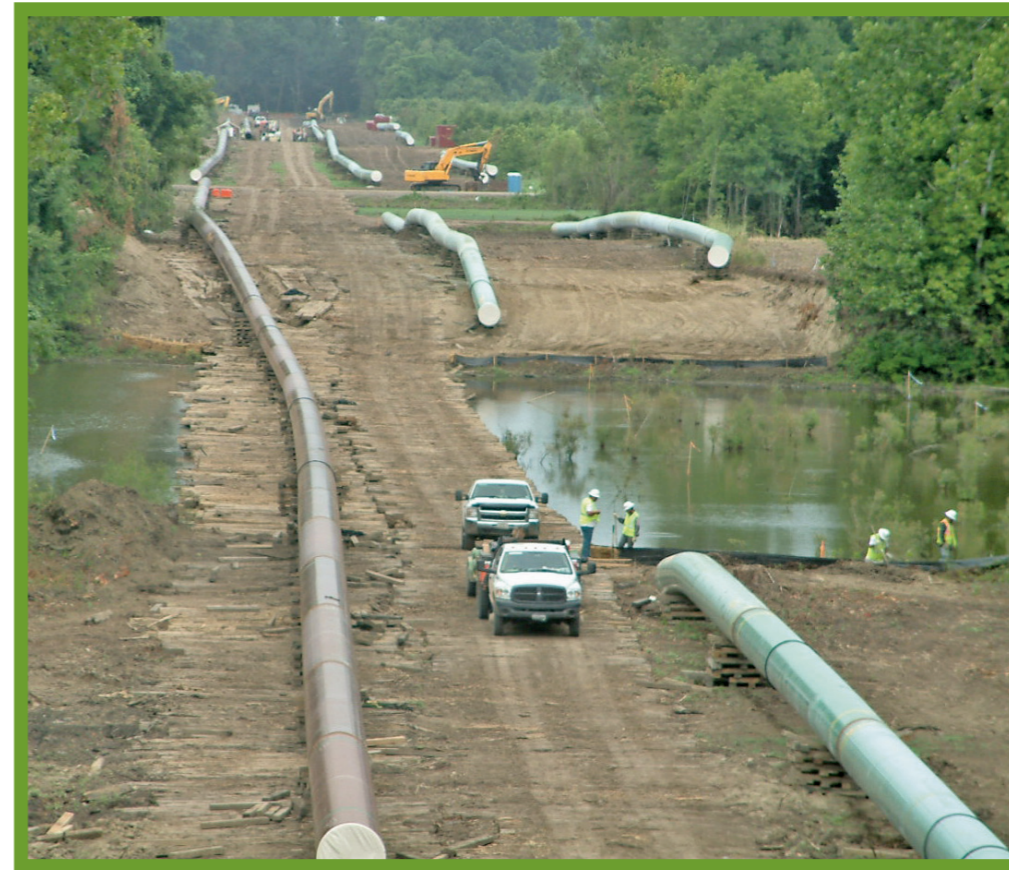
The Fayetteville Express Pipeline LLC runs from Conway County, Arkansas, to Panola County, Mississippi. Shown are scenes from Coahoma County.

Levee Board Responsible for Earthworks Portion in Coahoma County