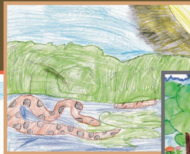
2nd Place — Shia Cooper, Walls Elementary, Walls