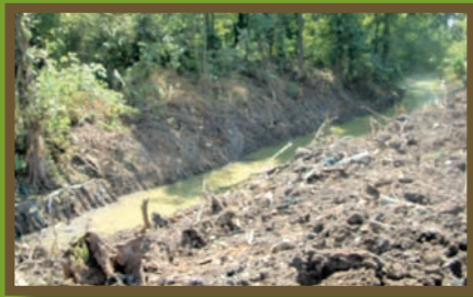
This drainage channel in Leflore County was recently cleared by the Yazoo-Mississippi Delta Levee Board.